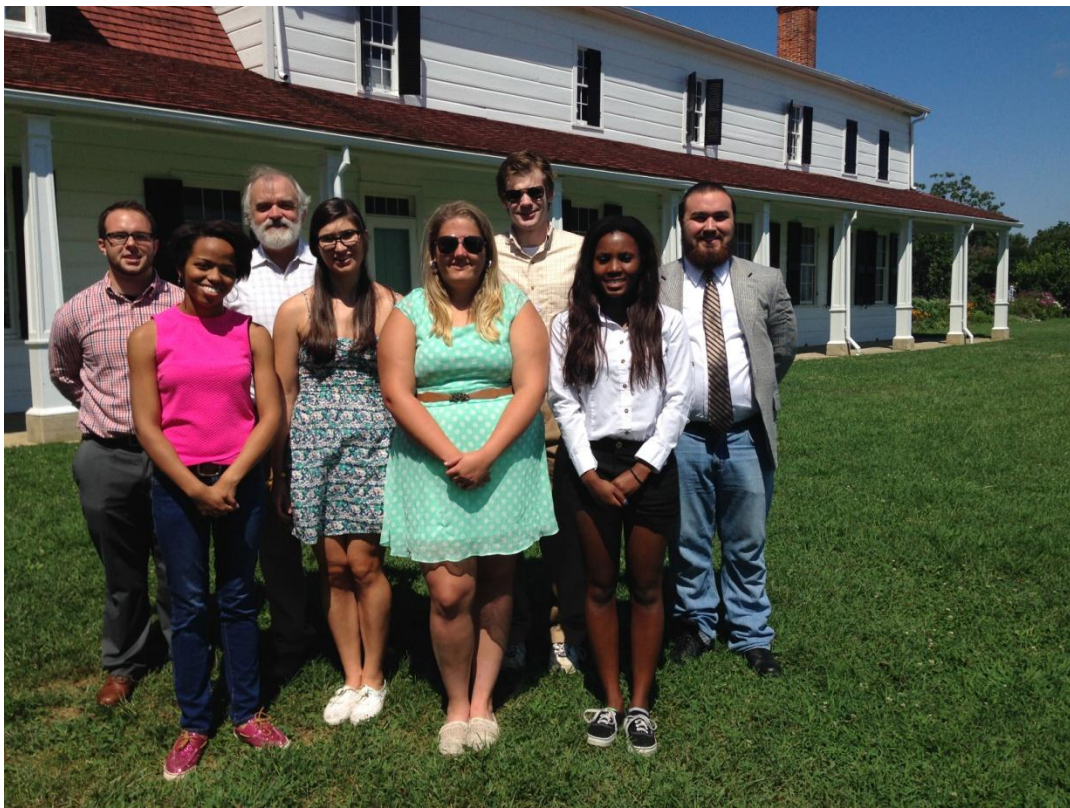
Assistants to the Author outside of the Sotterley mansion.